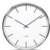
One 25 Index