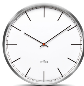
One 45 Index