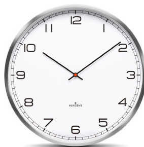
One 45 Arabic