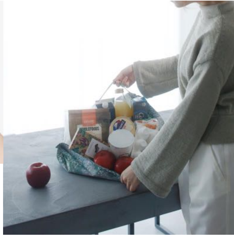
30 x 35 cm 11.8 x 13.8 in