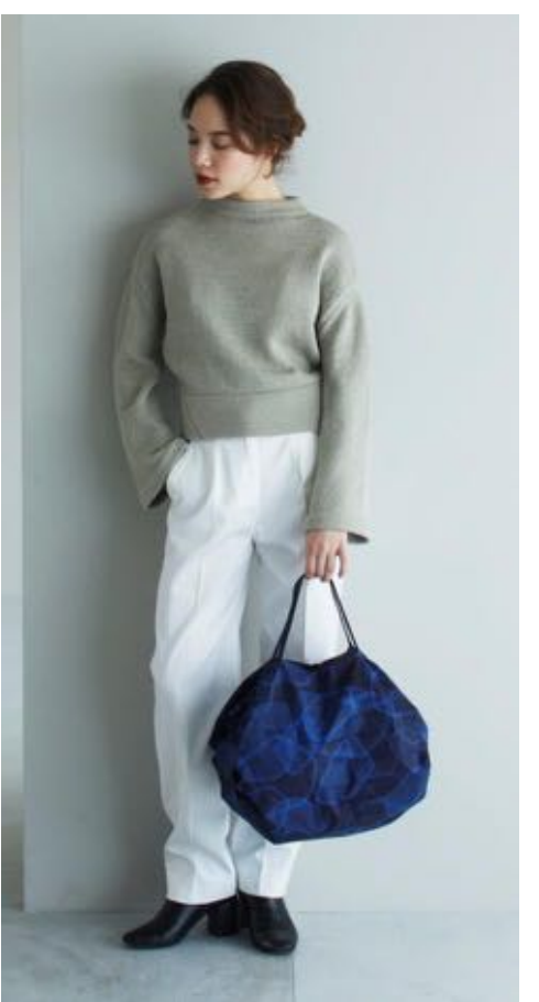
Northern Lights Snowy Peaks